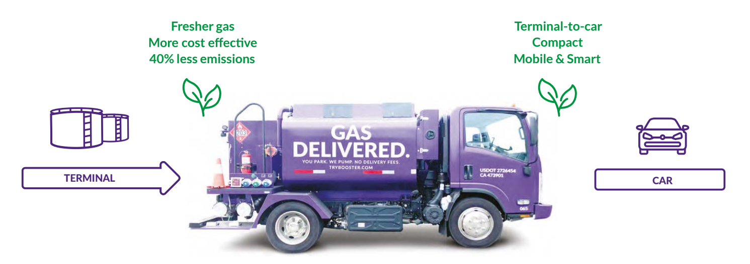
BOOSTER GAS SUPPLY